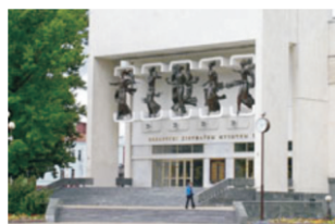
Belarusian State Academic Musical Theatre (8.9%)

(percentage of total theatre visits for the country)