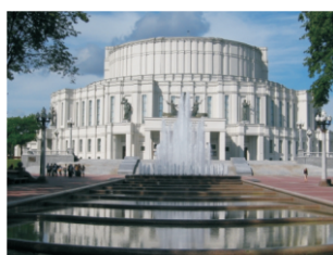
National Academic Bolshoi Opera and Ballet Theatre (12.9%)