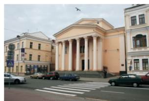
A.M. Gorky National Academic Drama Theatre (6%)